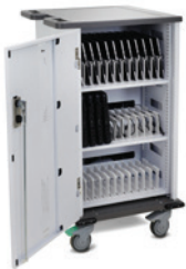
YES Basic Charging Cart YESBASGMPW4 white