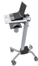
Neo-Flex Laptop Cart 24-205-214 two-tone grey