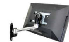
LX HD Wall Mount Swing Arm 45-268-026 polished aluminum Pivot 45-269-009 black