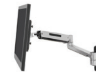
LX Sit-Stand Wall Arm 45-353-026 polished aluminum HD 45-383-026 polished aluminum