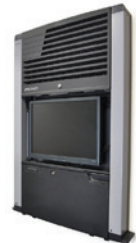
StyleView Sit-Stand Enclosure 60-610-060 black