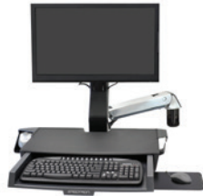
StyleView Sit-Stand Combo Arm Combo Arm with worksurface: 45-260-026 polished aluminum Combo Arm: 45-266-026 black head-assembly only, polished aluminum Extender Arm: 45-261-026 polished aluminum