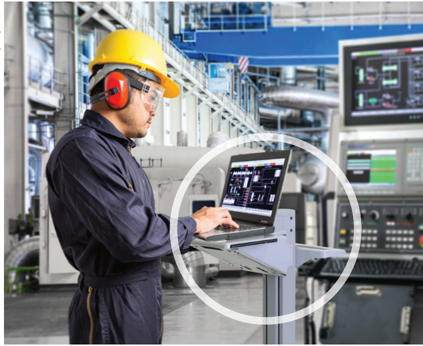
Neo-Flex Laptop Cart