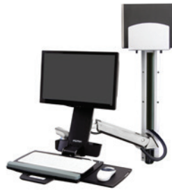
StyleView Sit-Stand Combo System Combo System with worksurface: 45-270-026 Combo Arm, medium CPU holder and wall track, polished aluminum 45-272-026 Combo Arm, small CPU holder and wall track, polished aluminum Combo System: 45-271-026 Combo Arm, medium CPU holder and wall track, polished aluminum 45-273-026 Combo Arm, small CPU holder and wall track, polished aluminum