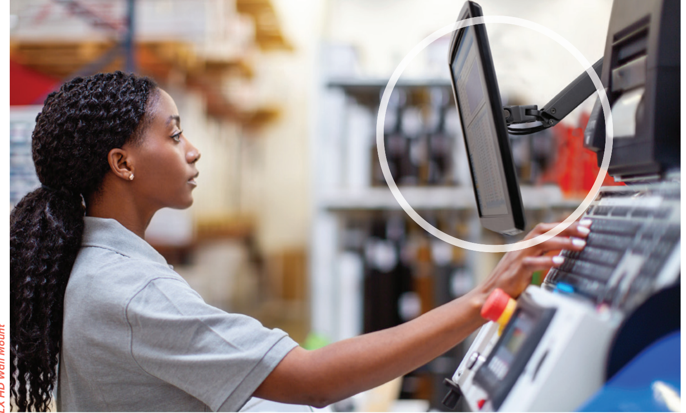
LX HD Wall Mount