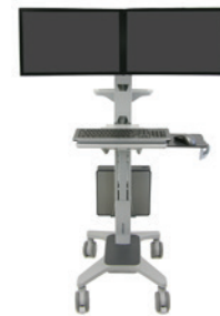
Neo-Flex WideView WorkSpace Dual LCD 24-194-055 two-tone grey