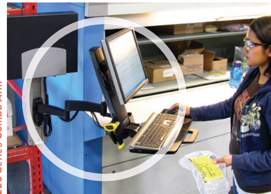
200 Series Combo Arm