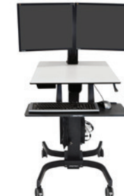
WorkFit™-C LCD LD (Light Duty) 24-215-085 black LCD HD (Heavy Duty) 24-216-085 black Dual 24-214-085 black