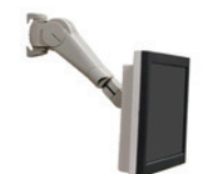
400 Series Wall Mount LCD Arm 45-007-099 grey 45-007-085 black