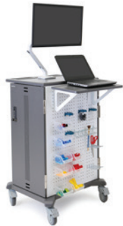
YES24 Adjusta™ Charging Cart YES24-CHR-1 white