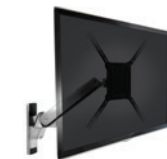
Interactive Arm HD 45-296-026 polished aluminum VHD 45-304-026 polished aluminum