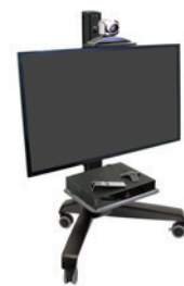
Neo-Flex™ Mobile MediaCenter LD (Light Duty) 24-190-085 black VHD (Very Heavy Duty) 24-191-085 black UHD (Ultra Heavy Duty) 24-192-085 black Camera Shelf Kit 97-491-085 660/700/800 mm Kit 97-489