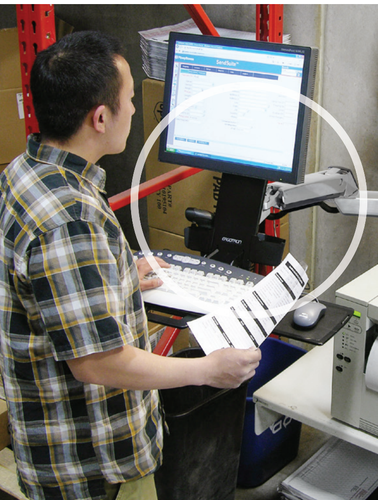
StyleView™ Sit-Stand Combo System