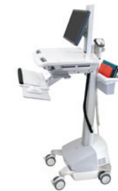
StyleView™ 42 Series LCD pivot version shown Powered with SLA or LiFe battery