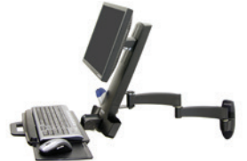
200 Series Combo Arm 45-230-216 white 45-230-200 black