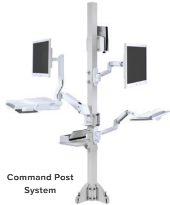
Command Post System