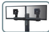
Dual Tall User Kit