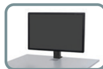
Single Monitor Kit