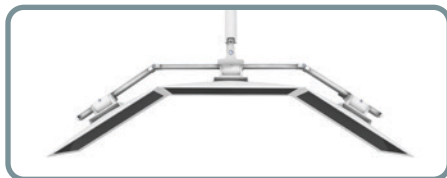
Triple Bow Kit