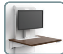
LD or HD Single Monitor Riser Kit