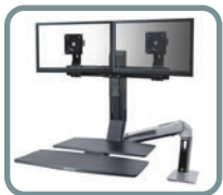
Tall User Kit