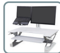
LCD & Laptop Kit