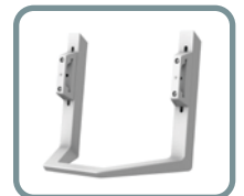
Dual Direct Handle Kit