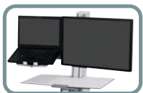
LCD & Laptop Kit