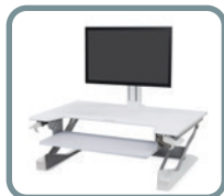
Single Monitor Kit