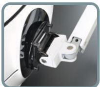
Heavy-Duty Tilt Pivot