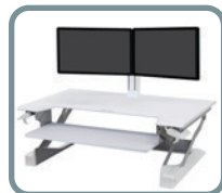
Dual Monitor Kit