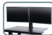
Dual Monitor Kit