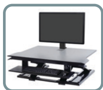
Single Monitor Kit