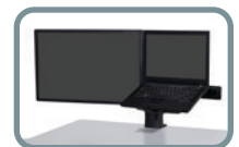
LCD & Laptop Kit