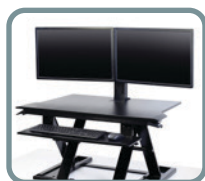
Dual Monitor Kit