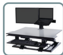
LCD & Laptop Kit