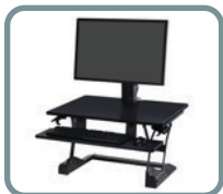
Single Monitor Kit